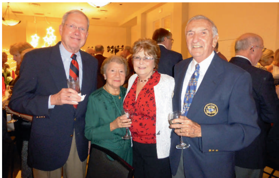
The Holiday Party 2015