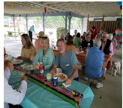
Pass the Salsa Please