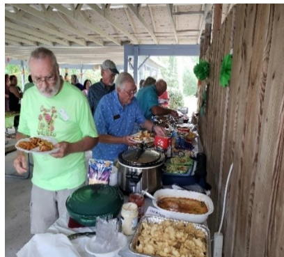
Lots of Good Food