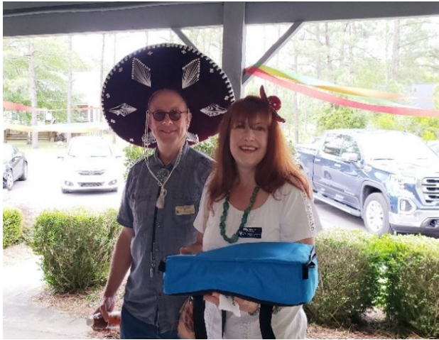
Some Gringos Showed Up