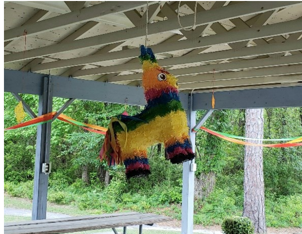
Pablo the Piñata Hung Out with Us