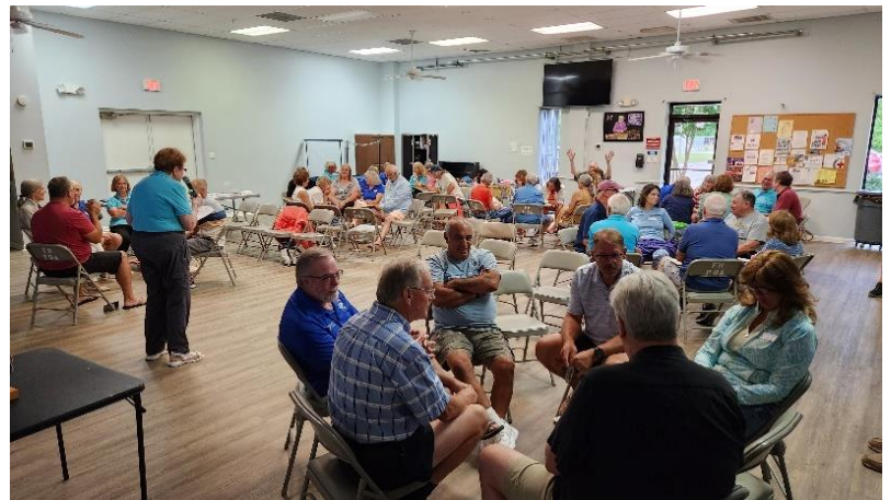
The teams took their work very seriously